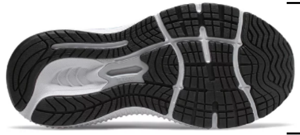
Shoe shown: New Balance 880v9 in Girls